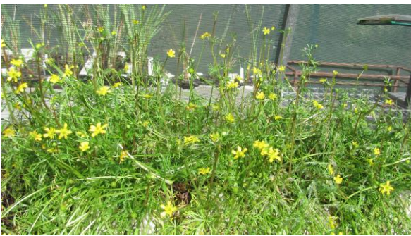
Ranunculus inundates River Buttercup