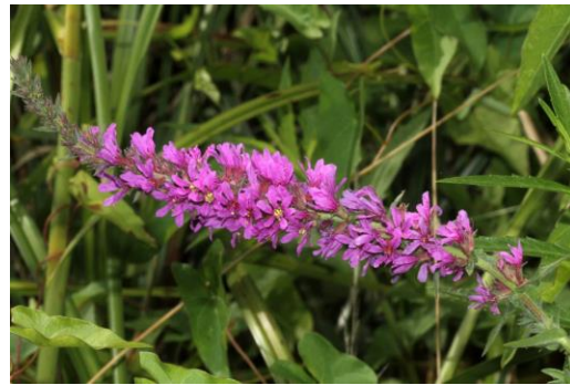
Lythrum salicaria Purple loosestrife Erect annual. Dies back after summer.

We also have a variety of rushes and sedges to add to a water feature. Do come and browse.