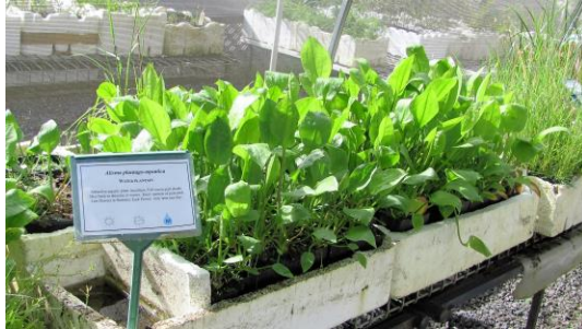
Alisma plantago aquatica Water Plantain

We have a plentiful supply of suitable plants. Now is the time to establish some of the plants (pictured), which die back during the winter months, but with care, flourish in the summer.