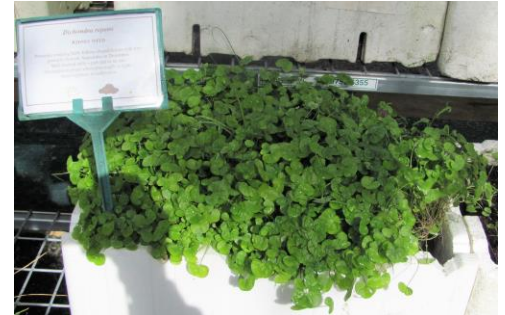
Dichondra repens Kidney-weed Dense spreading to form mat